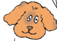
כלב = dog