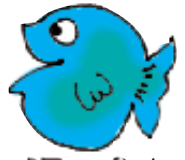
דג = fish

I am something you use in school. The letters in my Hebrew name add up to 293. Who am I?