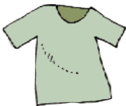
חליצד = blouse

I am something you wear. The letters in my Hebrew name add up to 133. Who am I?