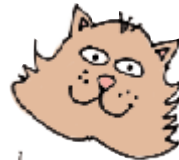
חתול = cat

I am an animal. The letters in my Hebrew name add up to 7. Who am I?