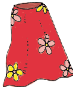
חצאית = skirt

Answers: גז (fish), זגל (ruler), חליצד (blouse)