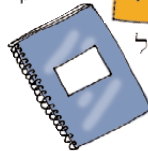
מחברת = notebook

I am something you wear. The letters in my Hebrew name add up to 133. Who am I?